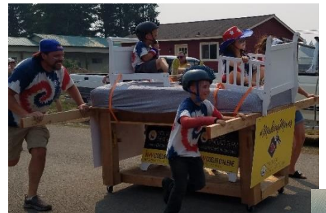
1st Annual Athol Daze Bed Races!!